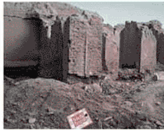
"Freedom Sign" after night time raid.

Recently, there has been growing concern among The American military over the inability to find and bomb Taliban forces accurately in northern Afghanistan. As a result, opposition forces and small teams of American Special Operations have been largely ineffective since they are unable to identify specific Taliban military positions for strikes.