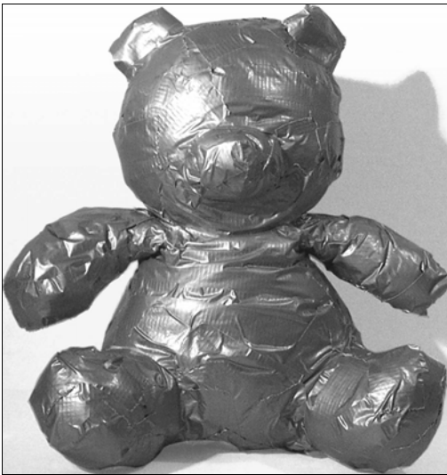
LG Williams, Duct Tape Teddy , 2003 31" high, Duct Tape and Stuffed Animal Edition of 10. © 2003 LG Williams. All Rights Reserved.