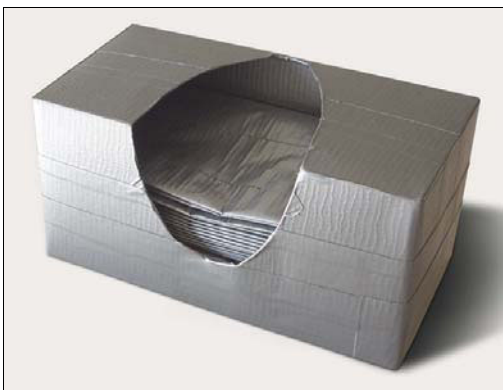
LG Williams, Duct Tape Kleenex , 2003 8" high, Duct Tape and Box of Kleenex Edition of 10. © 2003 LG Williams All Rights Reserved.