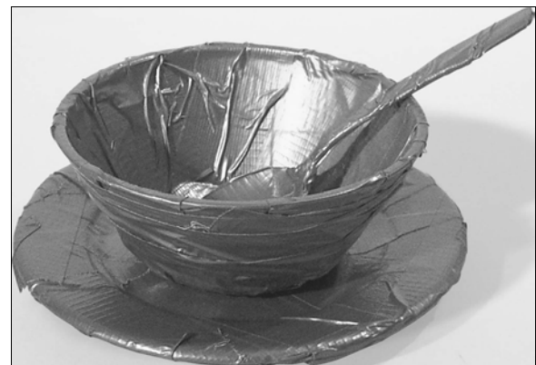
LG Williams, Breakfast in Duct Tape , 2003 30" high, Duct Tape, Spoon, Bowl and Plate Edition of 10. © 2003 LG Williams All Rights Reserved.

HIGH RESOLUTION PRESS IMAGES ARE AVAILABLE, PLEASE CONTACT: charles@lincart.com