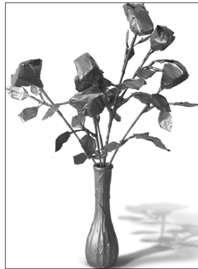
LG Williams, Still Life with Duct Tape , 2003 30" high, Duct Tape, Vase and Plastic Flowers Edition of 10. © 2003 LG Williams All Rights Reserved.